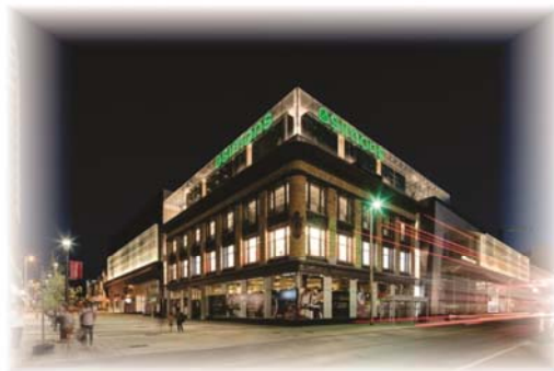
Rideau Centre Retail Expansion

The top award across all categories, in recognition of exceptional attention to project objectives, solutions and achievements; technical excellence and innovation; level of difficulty; and contribution to economic, social or environmental quality of life